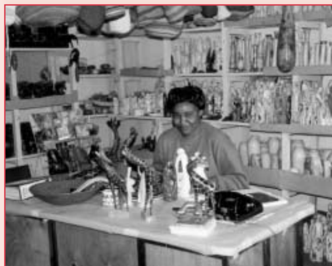
A client of WOCCU/Kenya.

Table 10 shows the top eight savings institutions, or ‘institution networks’, supported by USAID in 2001. These eight account for fifty-one percent of the clients and forty percent of the savings held by all the USAID supported institutions shown in Table 9. Three of the top eight are in Latin America, three in Asia, one in Africa, and one in Europe.