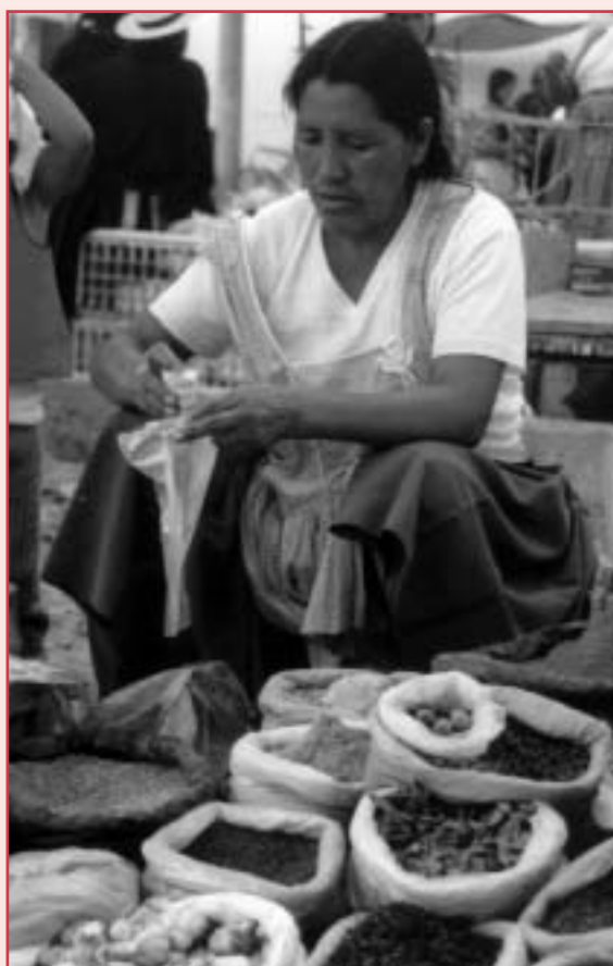
A client of CRECER selling spices and fruit.

USAID pursues an aggressive “action research” agenda by encouraging practitioners to explore innovative models that tailor microenterprise products and services to very poor clients. With USAID support, microfinance institutions developed and implemented a number of approaches that target the very poor, such as village banking methodologies, community-based self-help groups, credit combined with education services, and flexible savings services.